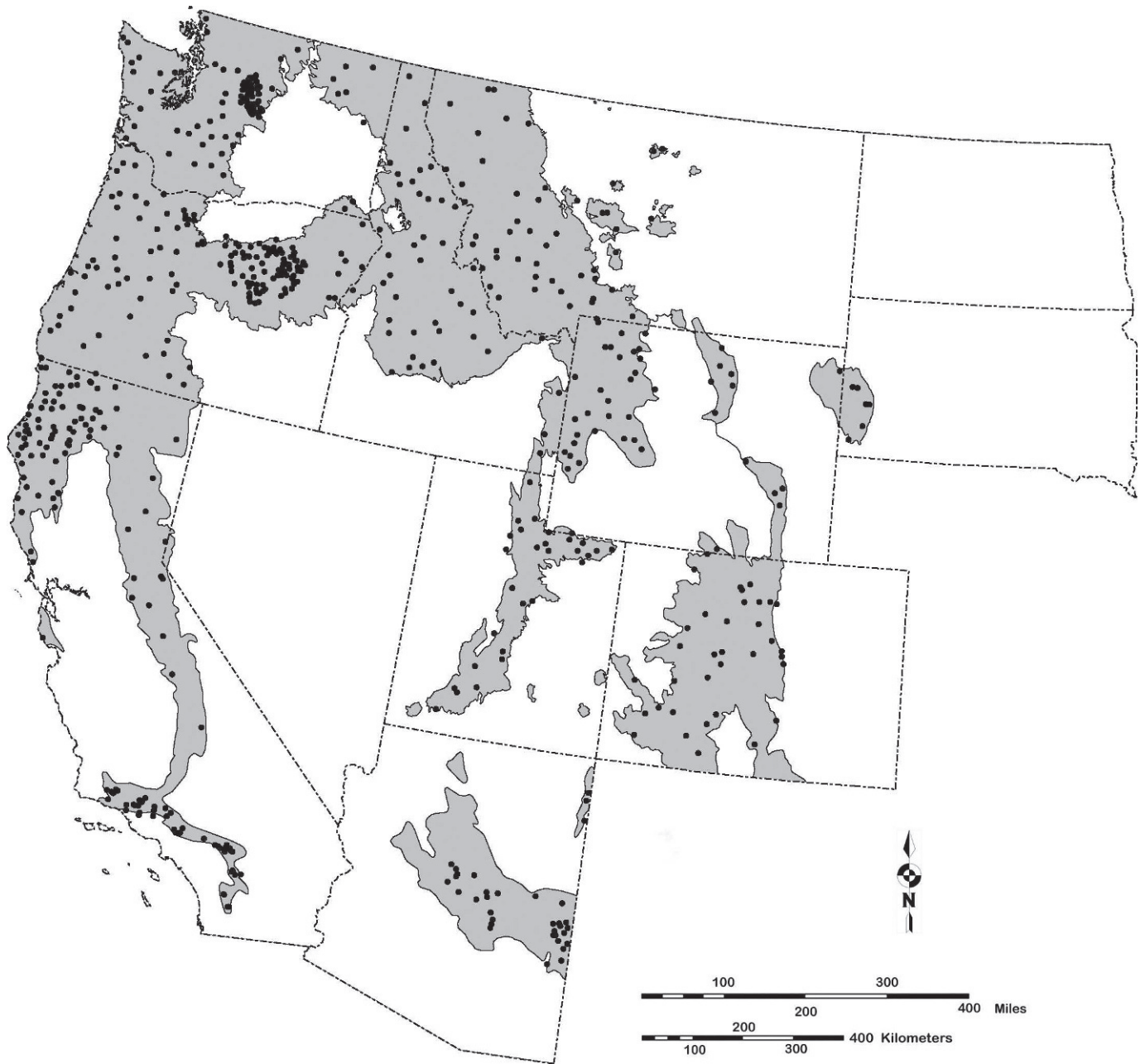
FIG. 1. US Environmental Protection Agency Environmental Monitoring and Assessment Program (EMAP)-West sample stream reaches in the Mountains ecoregion in 12 western US states.

(Herger and Hayslip 2000). Sediment is a major stressor in the Coast Range where other stressors, such as nutrient enrichment, toxic chemicals, or flow modifications that accompany agriculture, mining operations, and urbanization, are limited in extent compared to the rest of the western states.